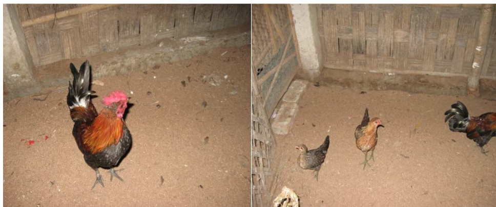
Figure 2. Mature F_1 of Hilly Male and Female.