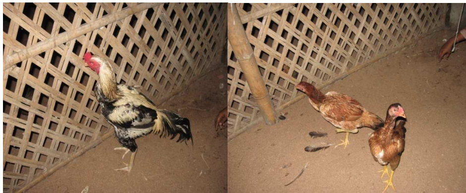
Figure 1. Mature Aseel Male and Female.

female 15.24±.22cm and 10.79±.10cm, 73.66±.76cm and 56.52±.53cm, 60.96±.43cm and 48.26±.42cm respectively. But the length of sickle feather was found 26.67±.77cm (Table 1).